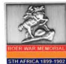
Lapel Pin $10.00 25 x 25 mm