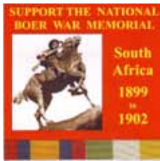
Car Sticker (10cm x 10cm) $2.00

When ordering, remember to complete details on page 12