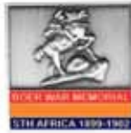
Lapel Pin 25 x 25 mm $10.00