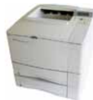
HP Laserjet 4050TN Network Printer