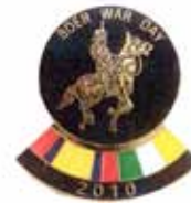
Lapel Pin 30 x 30 mm $8.00