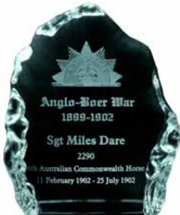
* Image shown with dark background to highlight engraving.

$120 + PP&I $22 (in Victoria, may be slightly higher in other states)