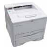
HP LaserJet 5000GN A4 /A3 printer

Proceeds will be donated to the Memorial fund.